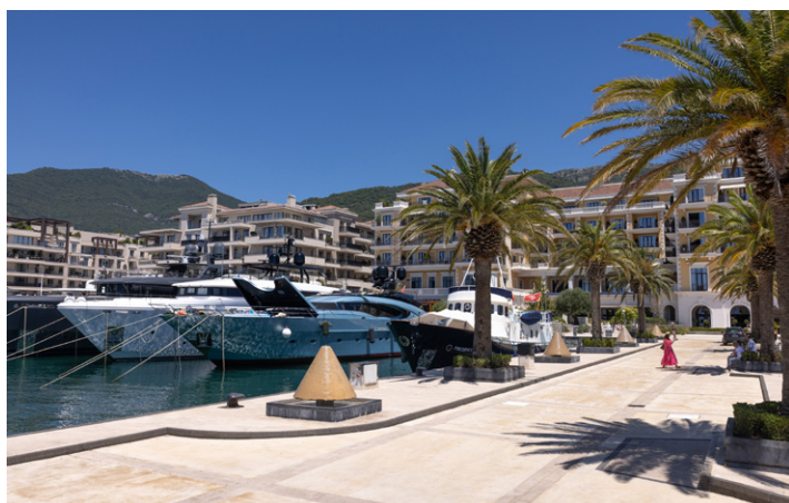
Luxury yachts moored in Tivat, Montenegro. The country attracts Russian and Turkish real-estate investments.

Montenegro is an attractive country for Russian and Turkish nationals to make real-estate investments, which constitute a significant portion of foreign direct investments. 50 Initially, some banks were reluctant to open accounts for individuals from these countries. However, following complaints, the Central Bank of Montenegro intervened and instructed banks to cease the discriminatory practices.