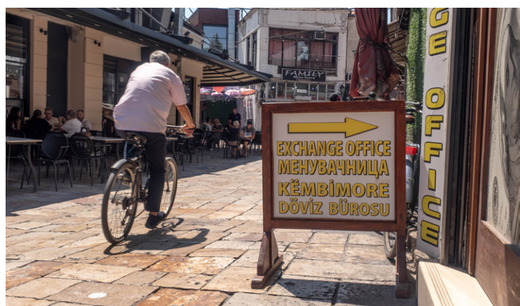
A currency exchange office in Skopje. Foreign exchange offices in the Western Balkans are exposed to risks from illicit financial flows.

Supervising foreign exchange offices is essential, although the authorities face challenges because of the large number of agents and the prioritization of other sectors, such as banks. Between 2021 and 2023, the Albanian Central Bank revoked the licences of 65 foreign exchange offices, most of which were located in Tirana. 103