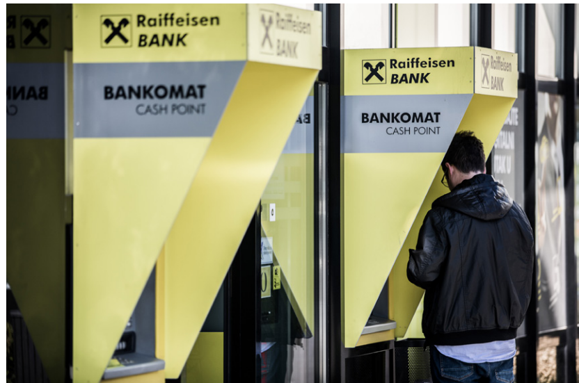
A Raiffeisen Bank cash point in Sarajevo. The former director of the bank in Bosnia and Herzegovina was arrested in 2021 on suspicion of financial crimes and money laundering.