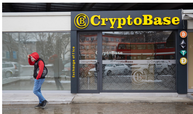
An exchange office for cryptocurrencies in Skopje. The risk of illicit financial flows through cryptocurrency is high in the Western Balkans.

digital currencies. 85 They claim that cryptocurrency transactions in Montenegro provide advantages such as guaranteed confidentiality, elimination of transaction-blocking risks, and reduced transaction time. 86 One agency even highlights increased privacy as a key benefit of using cryptocurrency and states that transaction parties are concealed, making it difficult for authorities to trace the transaction. 87 On the Crypto Real Estate website – one of the largest real-estate marketplaces – 95 properties were listed in Montenegro in August 2024, with prices ranging from US$288 000 to US$4.5 million. 88 Contracts at notaries are signed in euro rather than cryptocurrency and notaries pay little attention to the origin of funds, demonstrated by the low number of suspicious transaction reports (STRs) submitted: 19 between 2017 and 2022. 89